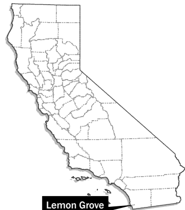
Fire Hazard Severity Zones (FHSZ) in Local Responsibility Area (LRA), as Identified by the State Fire Marshal