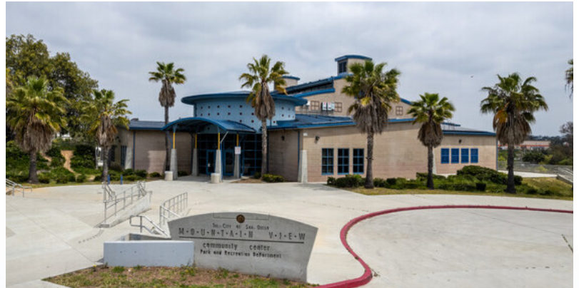
Mountain View Community Center 641 South Boundary Street San Diego, CA 92113

*Residents can also go online at DisasterAssistance.gov , use the FEMA mobile app or call the FEMA Helpline at 800-621-3362. The line is available from 7 a.m. to 10 p.m. daily.