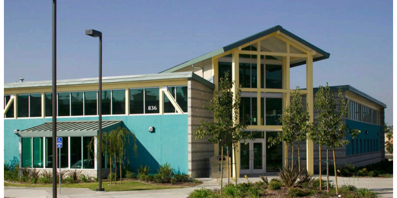
Spring Valley County Library 836 Kempton Street Spring Valley, CA 91977