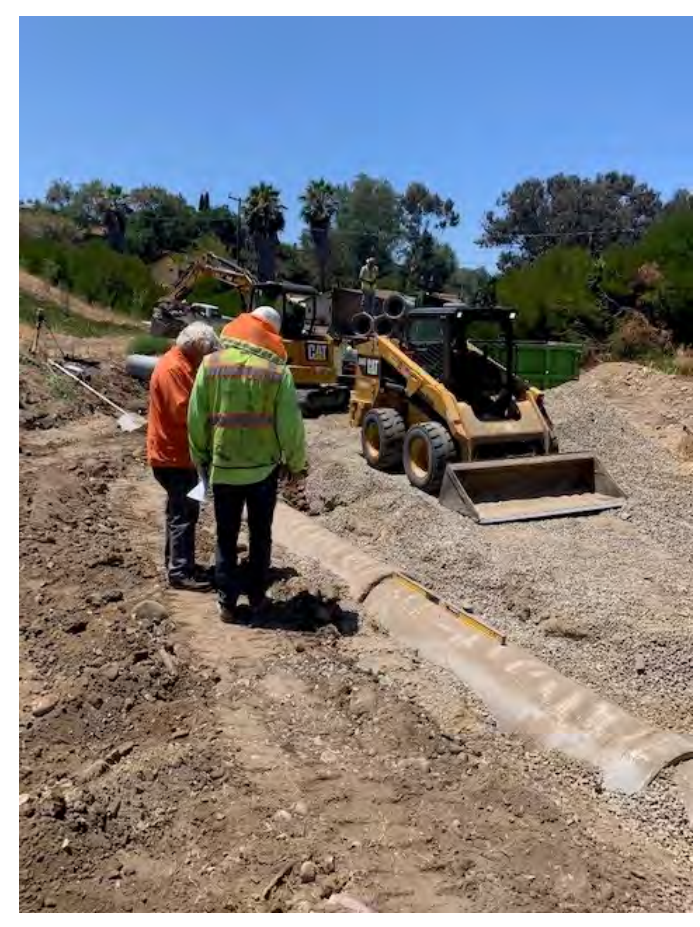
Re-Routed 18" RCP