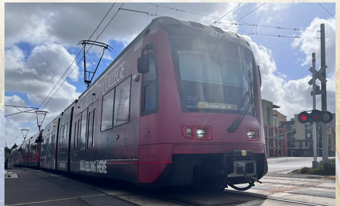
Photo: Metropolitan Transit trolley leaving the Lemon Grove Depot

The City would like to thank all the residents, businesses, and motorists for their patience and understanding as city engineers worked to get the project within safety guidelines.